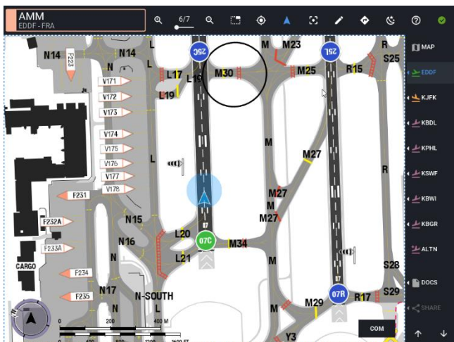
Lido Airport Moving Map in Lido eRM

The Lido Airport Moving Map (AMM) is a digital navigation tool designed for pilots and aviation professionals to enhance airport situational awareness with real-time aircraft positioning and dynamically rendered airport layouts.